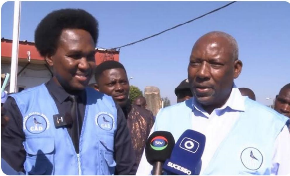
18:42 · 11/21/24 · 3K Views