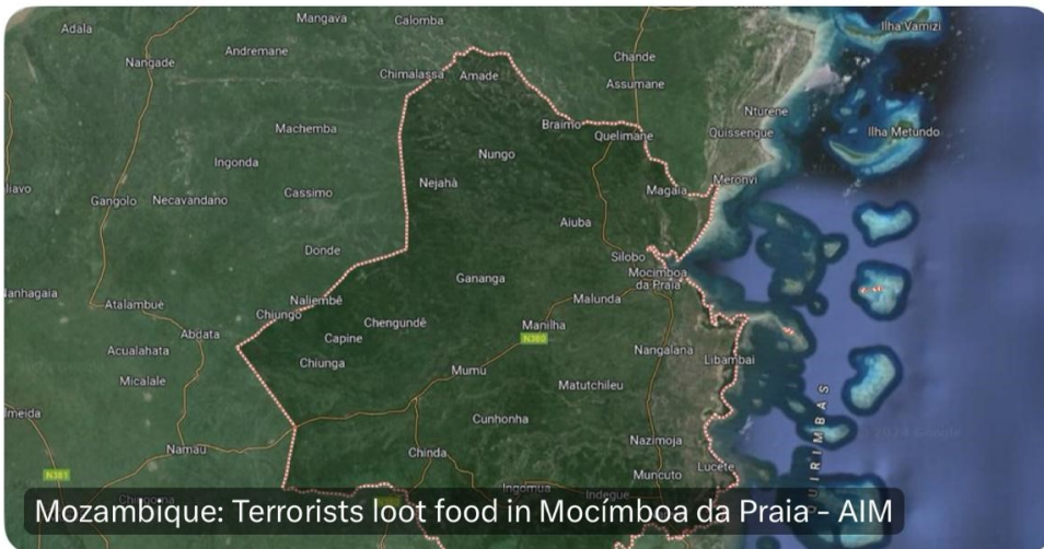
Mozambique: Terrorists loot food in Mocímboa da Praia - AIM

#Mozambique #Moçambique #CaboDelgado #News