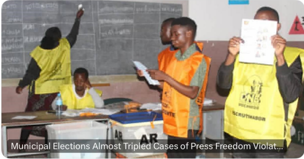
Municipal Elections Almost Tripled Cases of Press Freedom Violat...

Municipal Elections Almost Tripled Cases of Press Freedom Violations